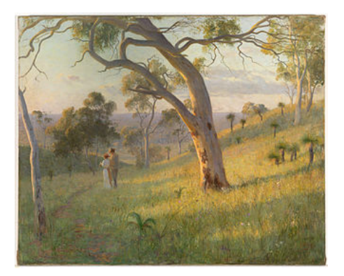
Florence Fuller, Golden Hour, 1905

There is still so much work to be done when it comes to researching the lives and influence of Australian artists inspired by Theosophy. So many of them deserve to be better known. In some cases their reputations as artists