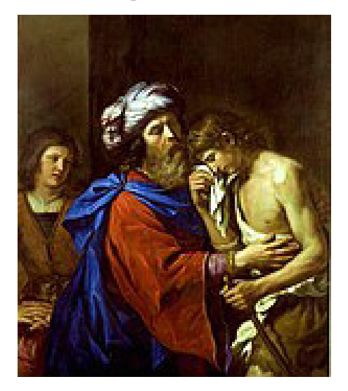
Guercino Return of the prodigal son

In that story a famine comes upon the land. The son is starving, lacking in spiritual nutrition. He is so hungry that he will eat the food that he is feeding the swine. This is the depiction of the soul's deepest descent. This is the