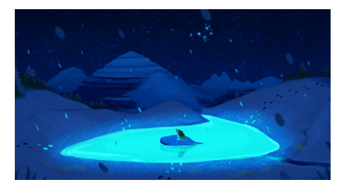
A Journey Home. Rendition of the Navajo Sacred Mountain of the North, Dibé Nitsaa.

that has grown within us during the course of the long flight into material existence, now to determine the best and most expeditious way for not only ourselves, but for all beings to make the journey home. This is where we find ourselves now.