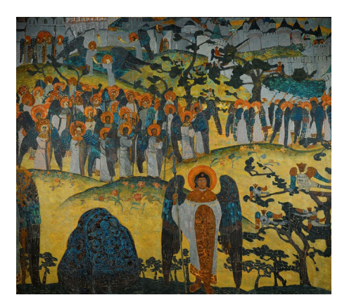
Nicholas Roerich, Treasure of Angels, 1905

"In beauty we are united Through Beauty we Pray With Beauty we conquer."