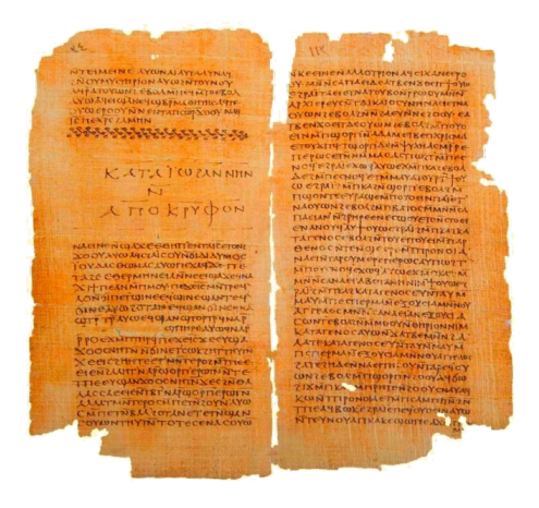
Gospel of Thomas and The Secret Book of John (Apocryphon of John), Codex II The Nag Hammadi manuscripts. Early Christian Gnostic texts

symbolise a new direction in modern art. Literally speaking, ours are the first eyes properly to see those warm, finely inscribed animal scenes of the Aurignacian period, fifty thousand years ago, because most of them were drawn in darkness with the uncertain aid of flickering torchlight.