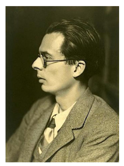
Aldous Huxley photograph by Henri Manuel, 1925 (Source: Wikimedia Commons)

and in its fully developed forms it has a place in most of the religions. The Perennial Philosophy forms a universal, intermittently visible stream which has had a profound cultural effect on civilization, east and west.