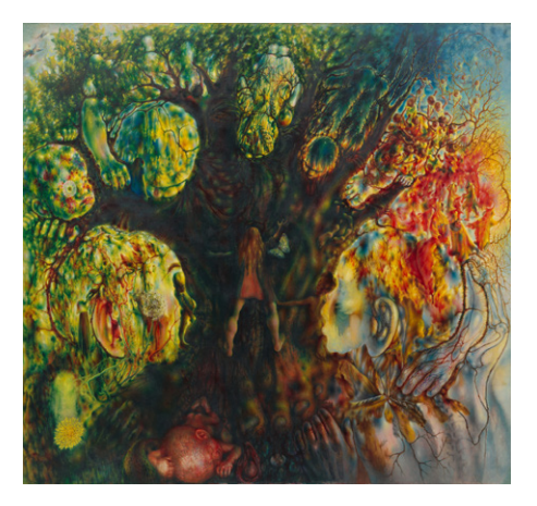
Pavel Tchelitchew Hide-and-Seek

At the Museum of Modern Art in New York there hangs a huge and mysterious painting called Hide and Seek by the Russian painter Pavel Tchelitchew. When we first look at it what we see is a great oak tree against which a girl is pressing herself: she is in a game of hide-and-seek. The hiders are children concealed in the tree. arranged like a cycle of the seasons; winter children, summer children, autumn children. But step back a few paces and these children become landscapes. A few paces more they are two folded arms as the tree resolved itself into a foot and hand. Further back again, it becomes the face of a Russian demon. And finally, the whole picture resolves into a drop of water. But at the