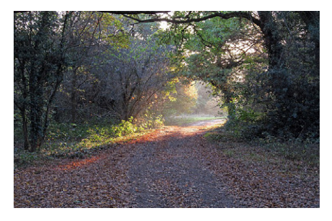
Light at the end of the path.

So, for us as humans, the understanding of this complexity is what is involved in the human project. In Light on the Path, we are advised to 'inquire of the earth, the air, and the water of the secrets they hold' for us, to look within, to examine the various streams, and to ask about what are those secrets that the various high intelligences that are operating within this human project have for us. 'Inquire of the Holy Ones of the earth of the secrets they hold' for us. 'Inquire of the inmost, the One, of its final secret', which has always been held for us. This is the process that we engage in when we reach the stage where we can finally choose, consciously.