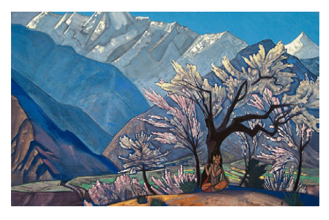
Nicholas Roerich, Krishna. Spring in Kulu, 1930

The chief objective of the Roerich Expedition was to create a pictorial record (in paintings by Roerich) of the lands and people of Inner Asia. The second objective was to survey the possibilities for further archaeological exploration and the third was to secure art treasures and ethnographical collections revealing the culture of Asiatic peoples.