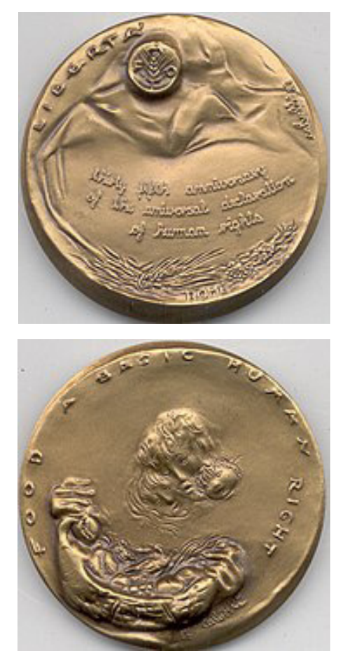
FAO Commemorative 1983 35th Anniversary of Declaration of Human Rights Bronze.

artificial, and counterproductive to human unfoldment.